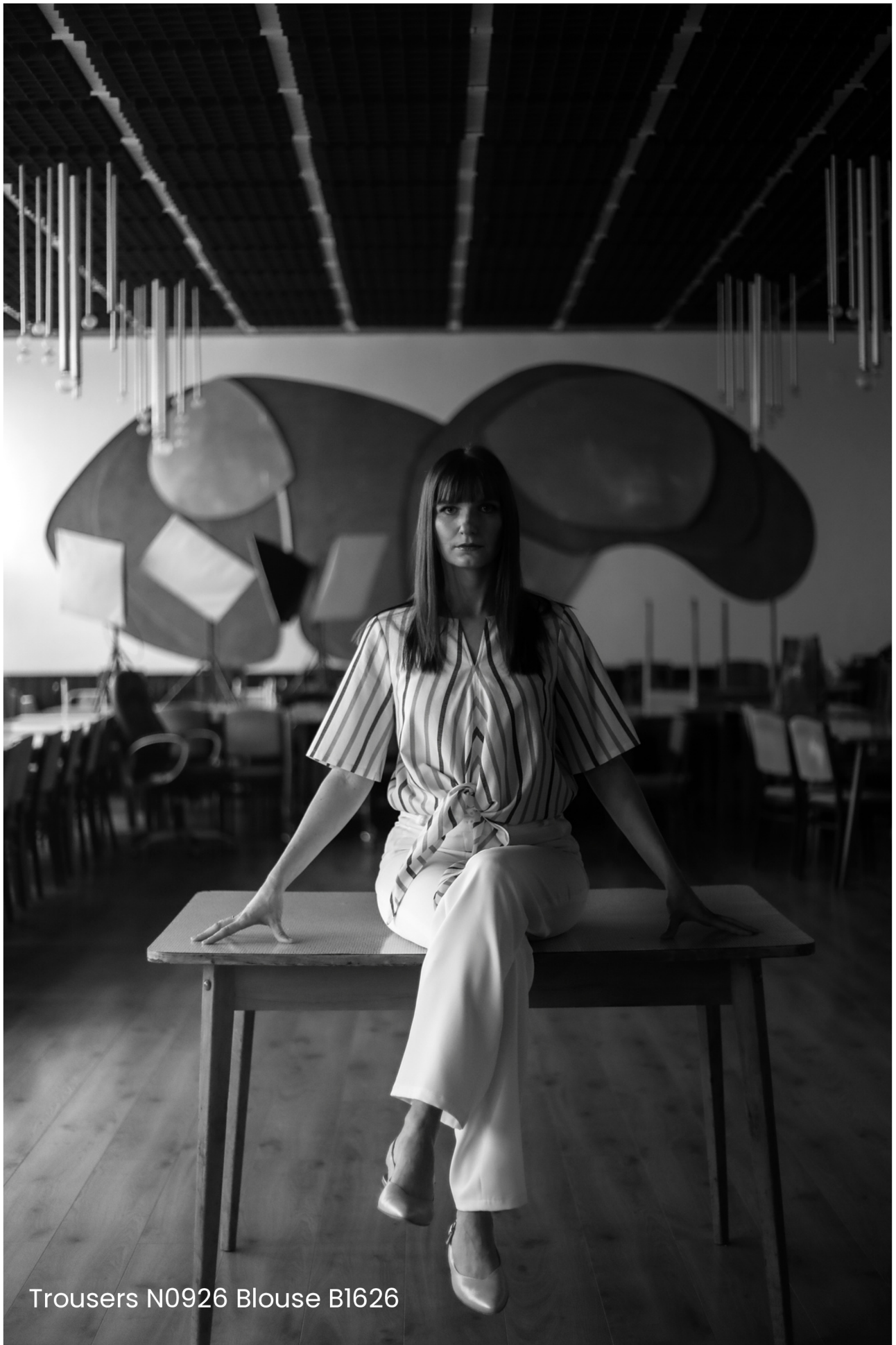
Trousers N0926 Blouse B1626