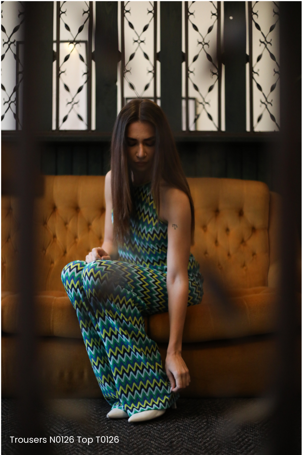
Trousers N0126 Top T0126